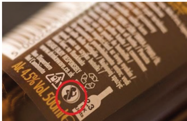
Fig. 4. Pregnancy pictogram in France

If pictograms are used, it is preferable that they are accompanied by a corresponding health information message. Furthermore, as on tobacco products, the specific size of the health information could be determined as a minimum percentage of the size of the container. The images used can be informational in style and taken from other ongoing education campaigns to enhance their effectiveness. Noticeability would be increased by placing the image on a contrasting background, with warnings printed in red rather than black (41).