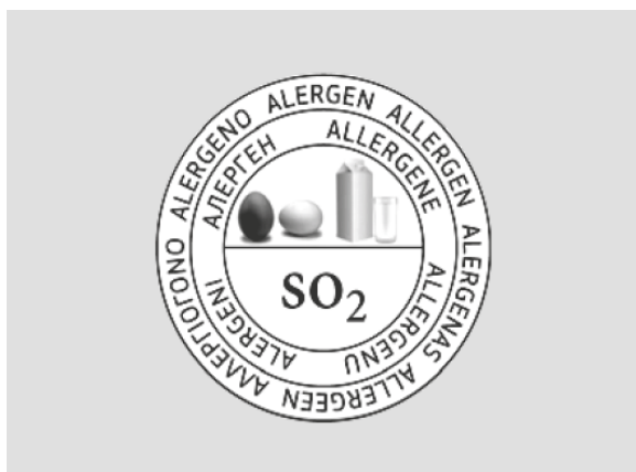
Fig. 3. Required allergen pictogram for wine

information provided to consumers, the listing may be accompanied by pictograms (40). However, the EU regulations only require listing of the most common allergens. Some people might be allergic to substances that are not considered common. Unlike for food products, ingredients listings for alcohol products are not obligatory. Hence, consumers cannot easily track whether or not ingredients they are allergic to are contained in alcoholic beverages. Requiring alcoholic beverages to list ingredients would substantially improve provision of information to consumers and allow them to track potentially problematic products.