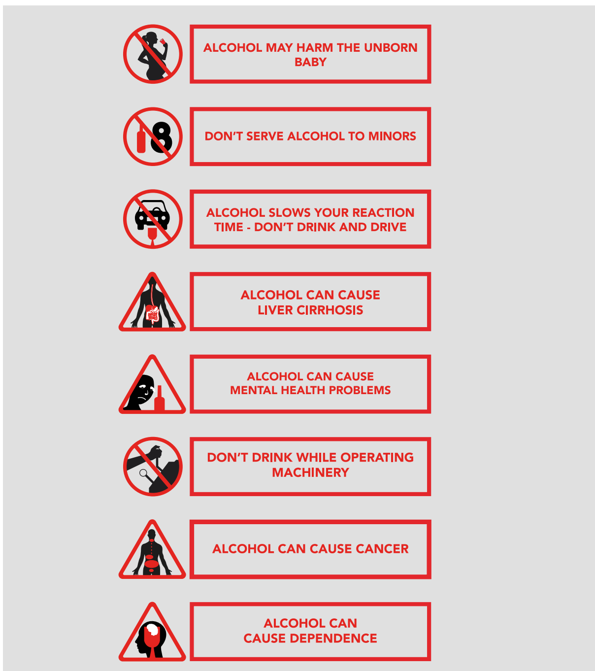
Fig. 5. Examples of warning text and pictograms for alcoholic beverages

by the United States public following its introduction. Similarly, pregnant women who saw the labels were more likely to discuss the issue; in addition, a “dose–response” effect was found such that the more types of information the respondents had seen (on adverts at point of sale, in magazines and on containers), the more likely they were to have discussed the issue (43). In France, comparable results were found in relation to the introduction of the pictogram in 2007 (Fig. 4). A study of public awareness regarding the dangers of drinking alcohol during pregnancy indicated a positive evolution in terms of changing the social norm towards “no alcohol during pregnancy” (46). Furthermore, information label messages may serve to legitimate a socially challenging intervention, such as increasing activities that aim to reduce the likelihood of an inebriated person driving a vehicle.