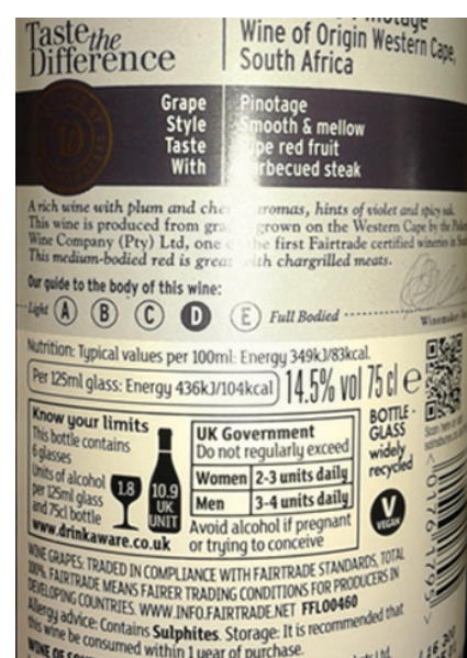
Fig. 6. Wine label in the United Kingdom from a supermarket's own brand

In addition, there is a growing acceptance of the key role that governments play in positively influencing consumers' dietary choices; to do so, they may use a range of preventative health approaches, including food labels where appropriate (3). Unfortunately, studies from the United Kingdom have found that a voluntary pledge by industry to provide information on the calorie content of alcohol did not lead to any significant provision of such information to consumers (47). Fig. 6 shows one of the few examples of a label produced in accordance with the pledge. Product-labelling regulation is an important instrument in promoting healthier habits and public institutions are ideally positioned to utilize it.