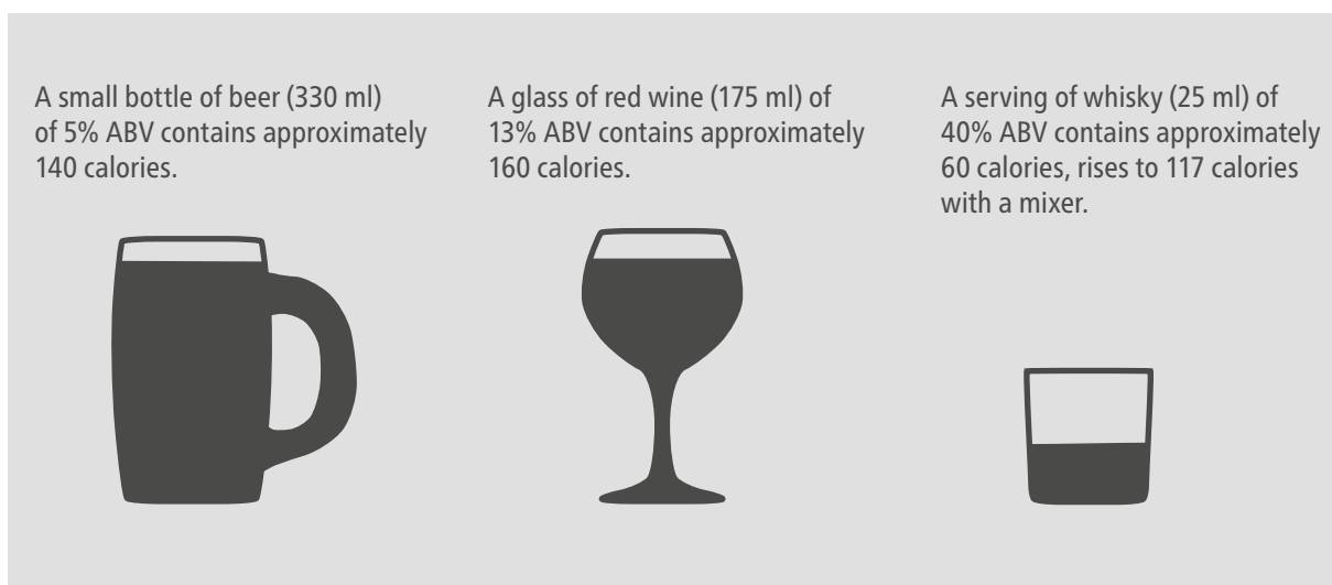
Fig. 2. Calorie content in beer, red wine and whisky